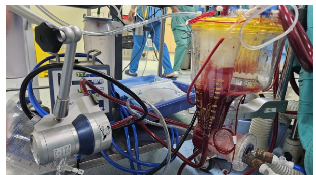
Fig 2: Low cost Hybrid Extra-Corporeal Membrane Oxygenator (ECMO) Circuit with Reservoir