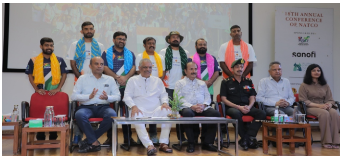
World Transplant Games 2025 athletes from Rajasthan were felicitated during the inauguration