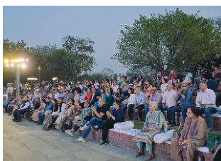
A captivating view of the audience engagement at Samarthan 2025