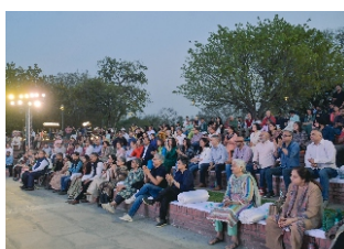
A captivating view of the audience engagement at Samarthan 2025