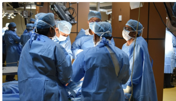
Participants at the wet lab