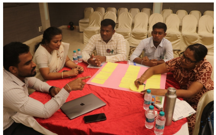
Documentation checklist in living donor transplant program (Group Activity)