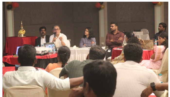
Establishing Altruism - Insights from Experts - Panel Discussion