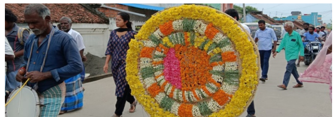
State honors for organ donors in Tamil Nadu - A top government official (IAS) from the Thiruvannamalai District carries a wreath during the last rites of an organ donor.

Since the inception of the deceased donation program, these five states from southern and western India have consistently advanced, while other regions have struggled to maintain momentum. This trend extends to eye donations as well, where these states continue to lead the country.