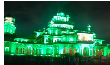
Albert Hall Museum, Jaipur