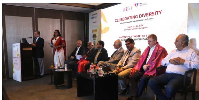
Inauguration of the workshop

This conference was organized in association with National Organ and Tissue Organization (NOTTO), Indian Society of Organ Transplantation (ISOT), Society for Heart Failure and Transplantation, Liver Transplant Society of India (LTSI), International Federation of Kidney Foundations - World Kidney Alliance (IFKF-WKA), and NATCO. The conference also received support from Trunome, TANKER Foundation, Mankind, Intas, Lal Path Labs, Sanofi and Sandor.