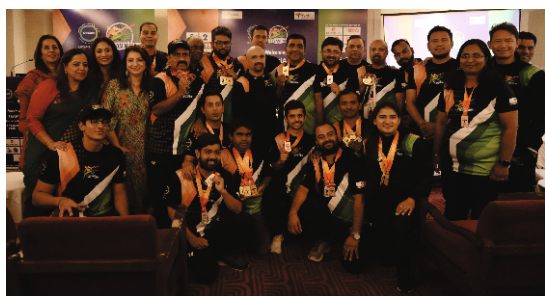
Press event in Delhi