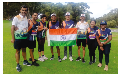
Athletes from Team India