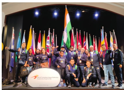
Team India at Perth

ORGAN India, Parashar Foundation, New Delhi, India