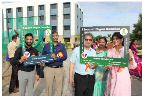
Guests supporting organ donation