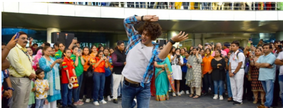
Audience joining the dancers