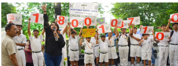
Students displaying Toll Free Number during the flash mob

On August 13, 2022, MFJCF and Delhi Public School, Jaipur organized a Flash mob at World Trade Park to spread awareness about organ donation. As the students swung to modern beats and songs of patriotism, many joined the campaign to support the cause. Around 300 people pledged as organ donors and registered for a donor card.