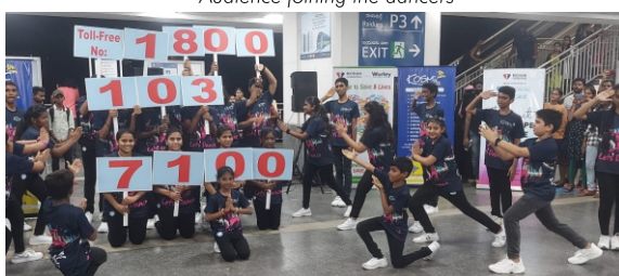
Flash mob at Ameerpet Metro Station