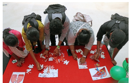
Jigsaw puzzle activity