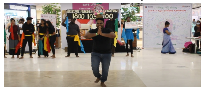
Folk dance performance at the Nexus Mall