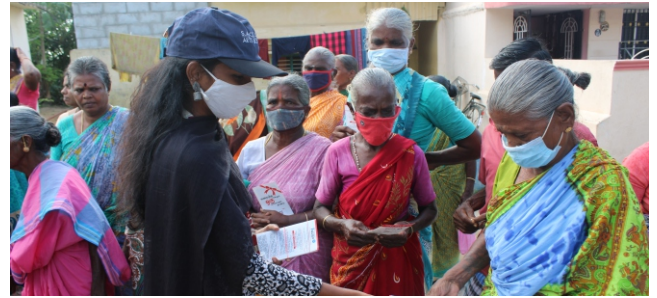
Distribution of awareness pamphlets

An awareness cycle rally was organized by S A College of Arts and Science (SACAS), Chennai in association with MOHAN Foundation on August 12, 2022. 73 students and a volunteer from Hyundai participated and cycled 32km spreading awareness. The Tamil Nadu Police extended their support by escorting the cyclists throughout the journey. The Madras Medical Mission Hospital supported the event with medical professionals and an emergency ambulance. Through the 32km journey, over 650 awareness pamphlets were distributed and over 80 organ donation helpline stickers were struck on the vehicles