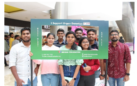
Students pledging to support organ donation

An organ donation awareness drive was conducted at the Nexus Forum Vijaya Mall, Chennai from September 15 -18, 2022. As part of the drive, a street play was performed by the students of Madras School of Social Work (MSSW). A bunch of volunteers from an NGO called Candles performed folk dances of Tamil Nadu with traditional music instruments such as Parai and Thavil. 'Life Before Ashes' - Art installations of human organs with the hard-hitting message - 'What has now become ashes, could have been another person's heart or kidney, if only the organs were donated' were kept for display throughout the event.