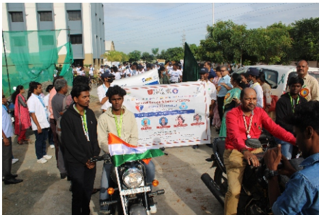
Inauguration of the cycle rally