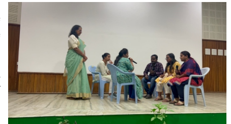
Roleplay on approaching families for organ donation