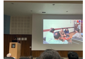
Film on grief counselling