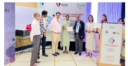
A candidate receiving her course completion certificate during the valedictory function