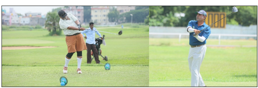
Golfers on the green