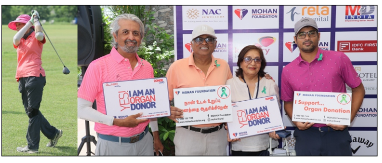
Golfers taking donor pledge at the event