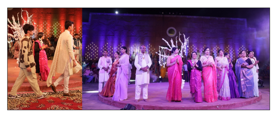
Ramp walk by donor families, recipients and models

The Madhyavarti of Jawahar Kala Kendra, Jaipur, witnessed a captivating fashion show on August 17, 2023, as part of the campaign "Celebration of Life". The event was jointly organized by MOHAN Foundation Jaipur Citizen Forum (MFJCF) and Community of Dreamers. The campaign culminated in a poignant fashion walk, where donors and recipients graced the runway, signifying the profound bond of life-giving generosity. This evening not only commemorated MFJCF's decade of service but also rekindled a deepened commitment for the years ahead.