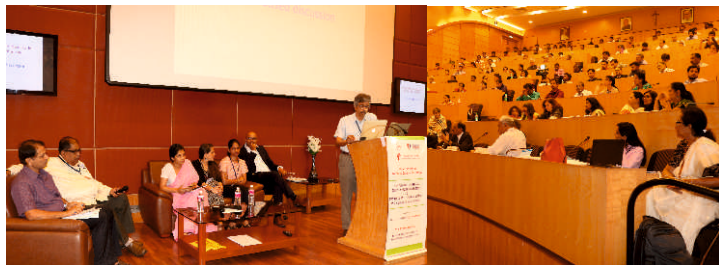
A panel discussion in progress

Network and Alliance of Transplant Coordinators (NATCO), in association with MOHAN Foundation held its 11th Annual Transplant Coordinators' Conference at St. John's National Academy of Health Sciences, Bengaluru on 3rd and 4th December, 2018. This year's event also saw NATCO and MOHAN Foundation partnering with the International Association of Bioethics to conduct a conference on the theme of 'Emerging Ethical Dilemmas in Organ Donation and Transplantation.' Furthermore, a symposium on 'Organ Donation and Transplantation in a World of Inequality' was organised by the Declaration of Istanbul Custodian Group (DICG) and the Foundation. Both these events were part of the pre-congress sessions that preceded the 14th World Congress of Bioethics.