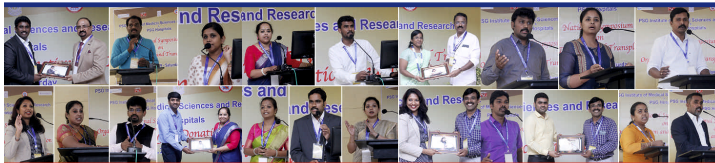
Transplant Coordinators at the Symposium