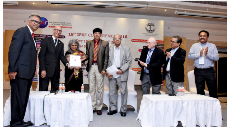
Dignitaries at the inaugural function

There were presentations on Sagliker Syndrome, Chronic Interstitial Nephritis in agricultural communities (toxic nephropathy), Acute Kidney Injury in Africa, and Managing HCV. The sessions on Managing and Fundraising for Foundations, Leveraging social media for Foundations, Role of media in influencing the public about organ donation and transplantation, and Awareness & screening In Tamil Nadu yielded critical insights on how to engage with the public. The consensus session dealt with slowing CKD progression with management of nutrition, obesity, and dietitian support. A Global Renal Internet Course for Dietitians (GRICD) is available.