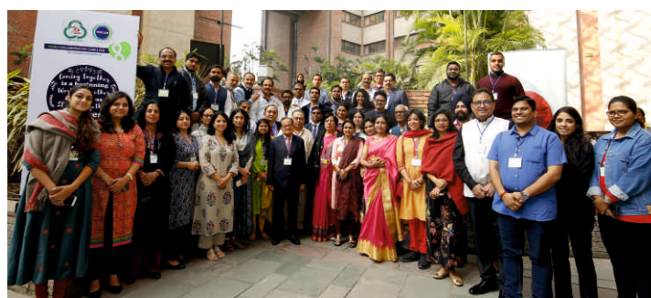
Participants at the Conclave