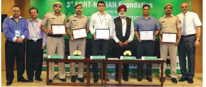
Police personnel being felicitated